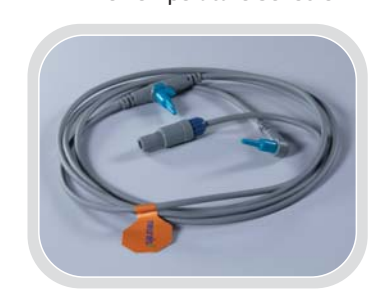
Dual Airway Temperature Sensors