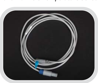
Airway Temperature Sensors