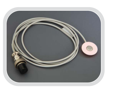
Infant Warmers Temperature Sensors