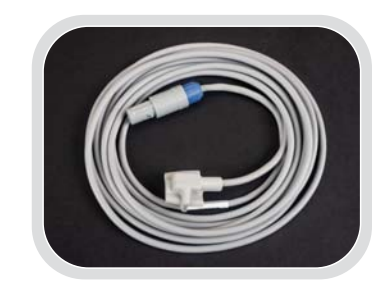
Neonatal Pouch Sensors