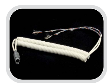
Defib Cable Assemblies