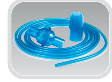
Diff. Pressure Flow Sensor