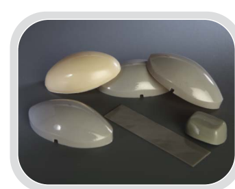
3D Probe Domes