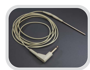
Oral Temperature Sensors