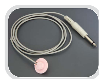
Skin Temperature Sensors