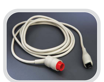
BL Transducer Cables