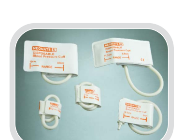
Disposable NIBP Cuffs