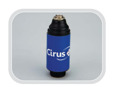
OS8 (3.5mm Stereo Jack)