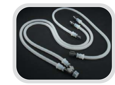
Silicon Neonatal Anesthesia Circuits