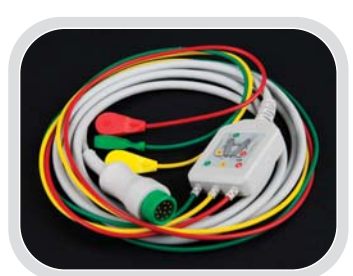
Moulded 3 Lead Cable