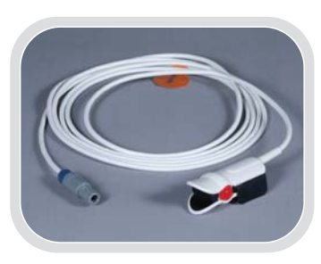
Adult Custom Sp02 Sensor