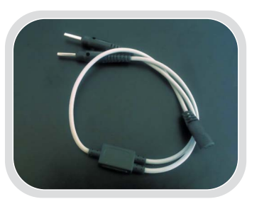
Bipolar Cables 2 pin