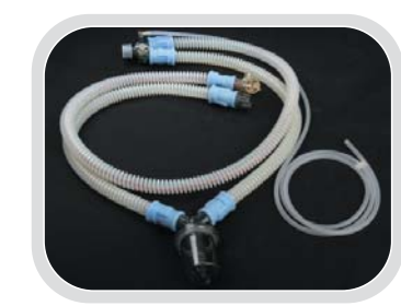
Silicon Pediatric Heated Wire Circuits