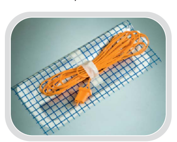
Earth Plate Disposable