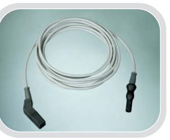
Bipolar Cable Flat Plugs