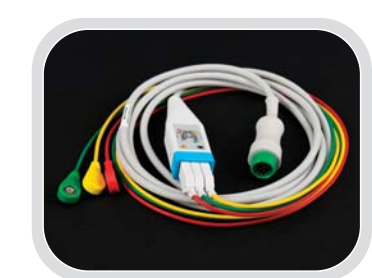
Deatchable 3 Lead Cables