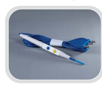
Monopolar Pencils Disposable