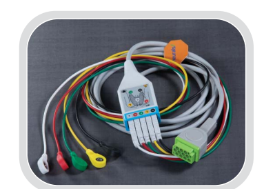
Detachable 5 Lead Cables