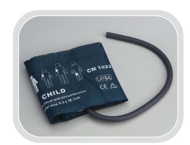
Reusable Child Cuffs