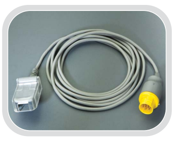
SpO2 Extension Cables