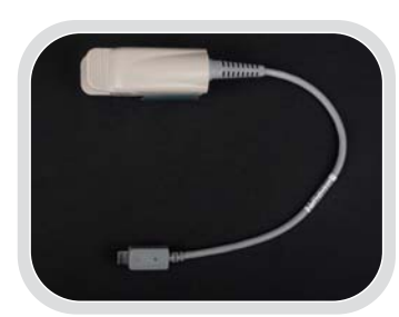
Type C SpO2 Sensor