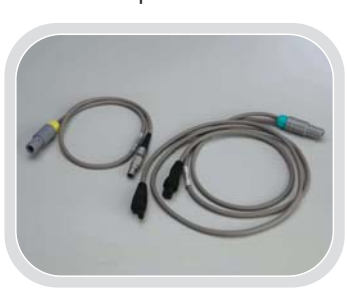
Heater Wire Adapter