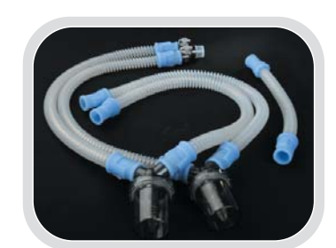
Silicon Adult DWT Circuits