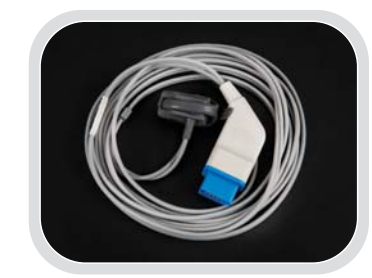
Neonatal Wrap Sensors