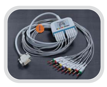
Detachable 10 Lead Cables