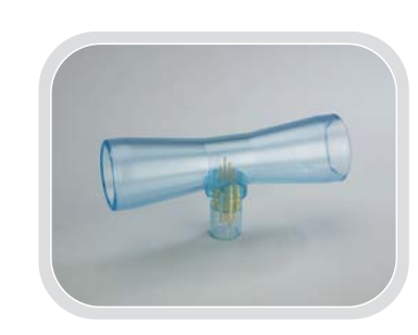
Hot Wire Flow Sensors

DESIGNED WITH PASSION. DRIVEN BY TECHNOLOGY.