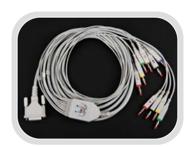
Moulded 10 Lead Cables