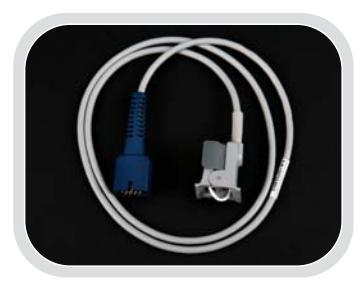
Pediatric Clip Sensors