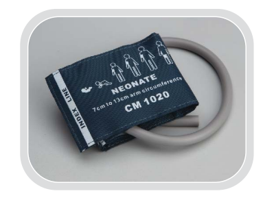
Reusable Neonatal Cuffs