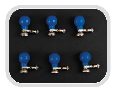
Chest Bulb Electrodes