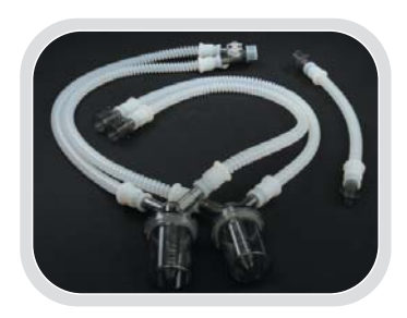
Silicon Neonatal DWT Circuits