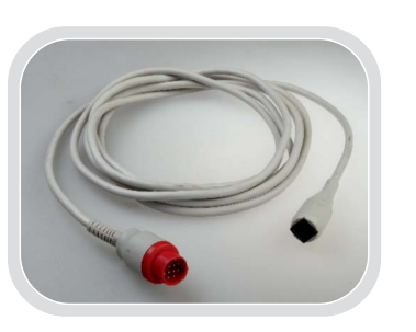
Abbot Transducer Cables