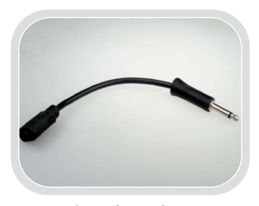
Patient Plate Adaptors