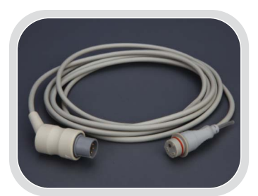
BD Transducer Cables