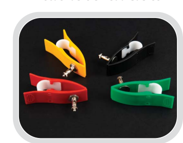
Clamp Limb Electrodes