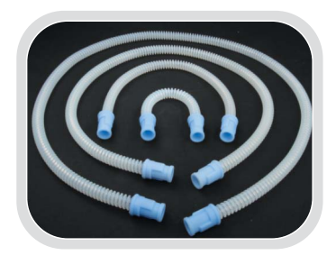
Silicon Corrugated Tubes