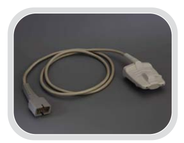
Adult Flex Sensors