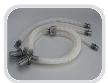
Light Weight Silicon Circuits