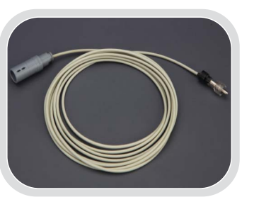
Inline Temperature Sensors