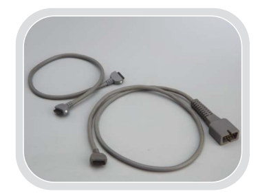
TI Module Accessories