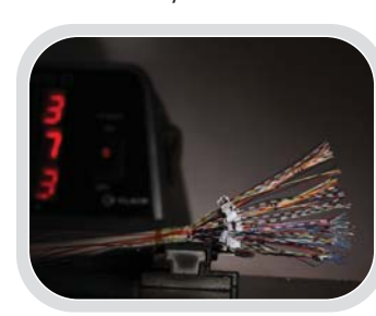
48AWG Cable Harness