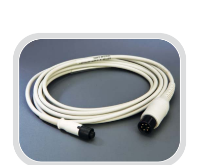
Medex Transducer Cables