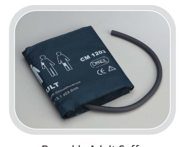
Reusable Adult Cuffs