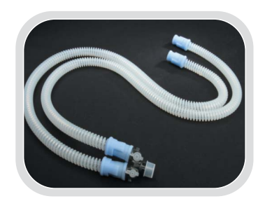
Silicon Adult Anesthesia Circuits