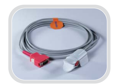
Adult Clip Sensors

Highly accurate & reliable, Cost-effective Compatible with a variety of existing monitors. Patient safety and clinical efficiency to the hilt, 100% latex-free to cut the risk of allergic reactions, medical grade cables, Perfect signal quality, cut your sensor expenses. Available in Adult clip, Adult flexible silicon, Multisite 'y', neonatal wrap, paediatric clip, and paediatric flexible silicon. Custom made length specifications could built upon request. Complies with EN 60601-1-2, EN 60601-1, ISO 80601-2-61, ISO 10993