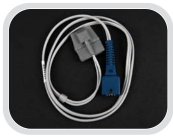
Pediatric Flex Sensors